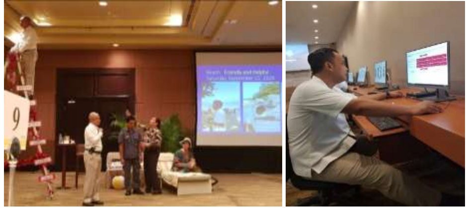
Figure 1. Class room training and online training activities at The Westin Resort Nusa Dua

To ensure that companies can survive and compete in an increasingly competitive environment, training and development activities are carried out to help employees learn jobs more quickly and effectively. Furthermore, this activity will reduce turnover between new and old staff, increase job performance and thereby free up manager time, as fewer mistakes are made, and less time has to be spent correcting them (Mansour, 2013). Training and development activities are carried out in several methods, namely online training, class room training, blended training and cross training. Individual training is more often done online. There is a platform called the Marriott Global System (MGS) where various materials and information are available on this platform. Each employee has personal access to enter this system in the form of a secret ID and password. Classroom training is usually mandatory training where all employees are required to attend this training without exception. This training is usually carried out in one of the meeting rooms and the schedule is divided into several waves with the consideration that this training activity can run without disrupting hotel operations.