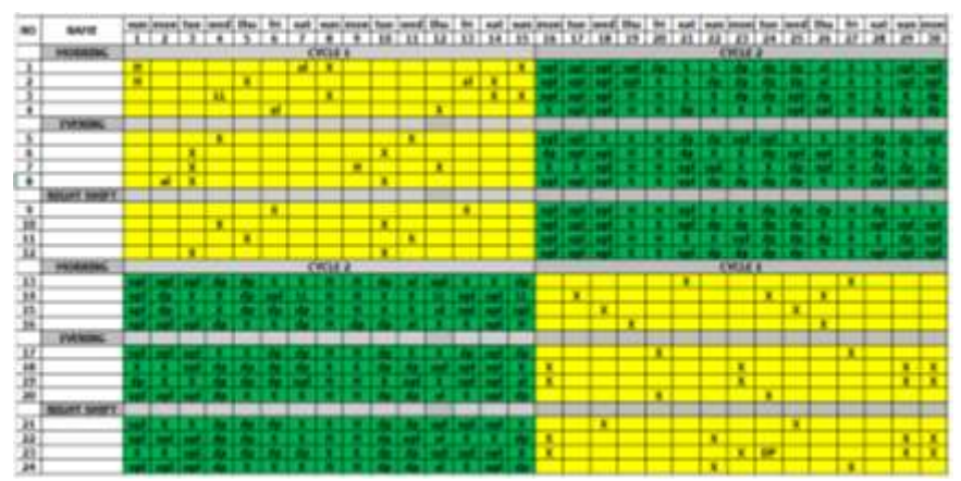
Figure 2. Work schedule schematic illustration