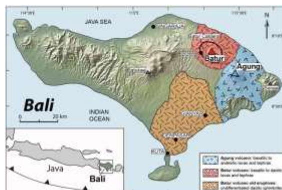
Figure1. Map of Gunung Batur

Kintamani District is one of sub-districts in Bangli Regency which has an area of 366.92 km 2 , or about 70.45% of Bangli Regency area and is even the largest sub-district in Bali Province (6.51% of the total area of Bali Province). The uniqueness of the sub-district is that it has a Batur caldera geopark measuring about 13.8 × 10 km, and other caldera structures formed in the middle with a diameter of 7.5 km and the tributary of Mount Batur with the highest peak of +1,717 m (Sinarta & Sumanjaya, 2018). In Mount Batur area there is also a lake with the same name, namely Lake Batur which is located in a high area, which is 1,050 meters above sea level with an area of 16 square km with an average depth of 50.8 km (Mudana et al., 2018).