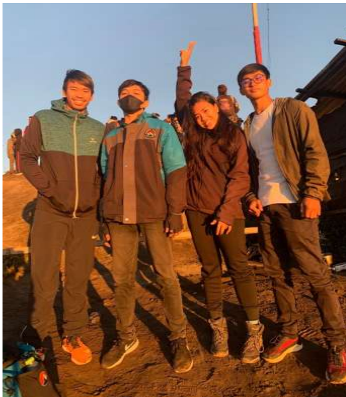
Figure 4. Climbing Mount Batur by keeping it clean from garbage.

hiking trails: Organizing the number of climbs per day so that there is no overload that causes damage to the climbing route. (2) Vandalism: The management of Mount Batur made regulations by forbidding climbers to bring equipment commonly used for vandalism activities, namely markers, pilox, and other stationery or dyes. The manager together with nature lover volunteers will also clean up the graffiti done by climbers by using a liquid that can be used to remove writing marks or scribbles left by climbers. (3) Trash: Carrying out mountain cleaning activities with the nature lover community which is routinely carried out every year where the last was carried out on October 24, 2020. Checking the luggage of the climbers at the main post and then the climbers are asked to fill in the blanks regarding what items are brought. The manager always provides briefing and socialization to each climber to bring down the waste generated during the climb. (4) Alternative accident prevention: To avoid accidents in the implementation and post-climbing, there are four conditions that are recommended for people who want to climb, namely: have good physical and mental conditions, have knowledge of the mountain to climb and good skills, have careful planning, and are supported by adequate equipment (Sukarmin, 1995).