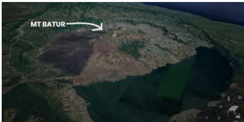
Figure 2. Appearance of the peak of Mount Batur

Due to the relatively normal climbing time, it is very suitable for beginners, only because the terrain is quite heavy, complete preparation is needed, starting from physical health, adequate logistics, warm clothes, shoes that match the natural terrain, flashlights and climbing sticks. According to Witarsana et al (2017) there are many things that motivate the wider community to climb Mount Agung, namely wanting to get a different atmosphere, wanting to do new things such as mountain trekking and wanting to relax at the top with beautiful and calm views.