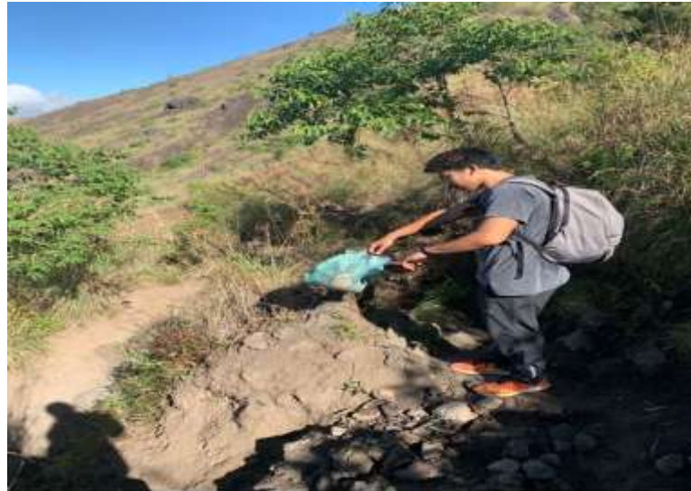
Figure 3. Hikers unloading plastic waste from the top of Mount Batur

suffered damage caused by the number of climbers increasing per day without any restrictions on the daily climbing quota. Other damage was that some climbers were still doing doodles on the rock and some were picking edelweiss flowers along the hiking trail.