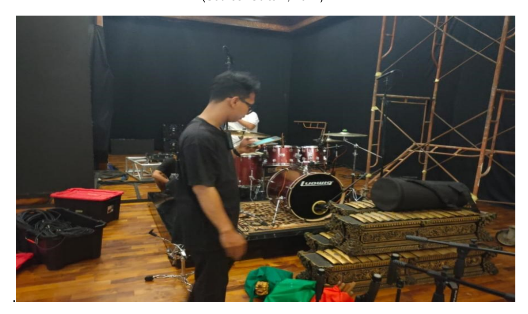
Figure 8. Helping lower the musical instruments down the stage.