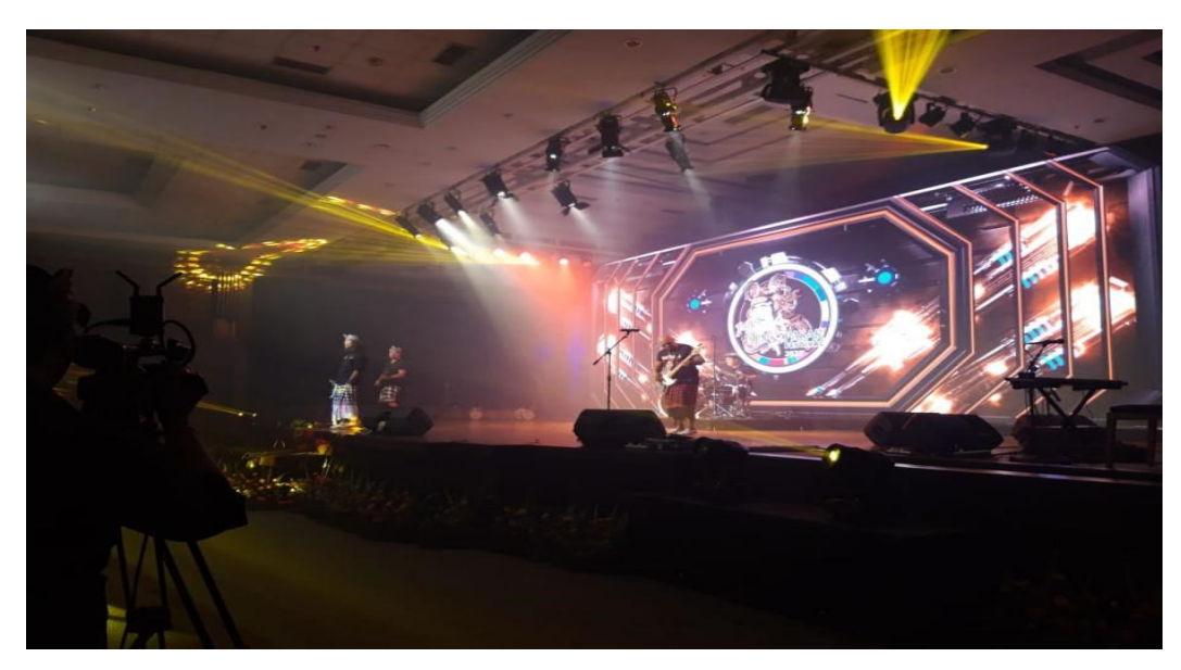
Figure 7. The event on 10 December took place with great fanfare.