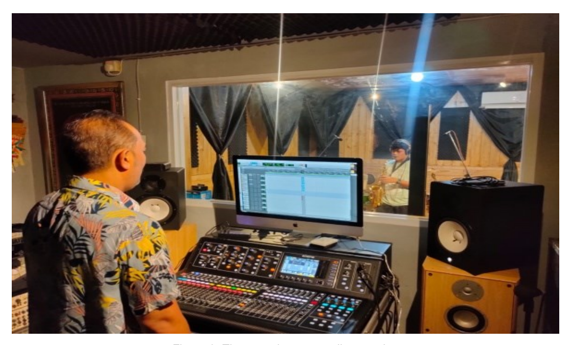
Figure 3. The saxophone recording session (Source: Gultom, 2021).