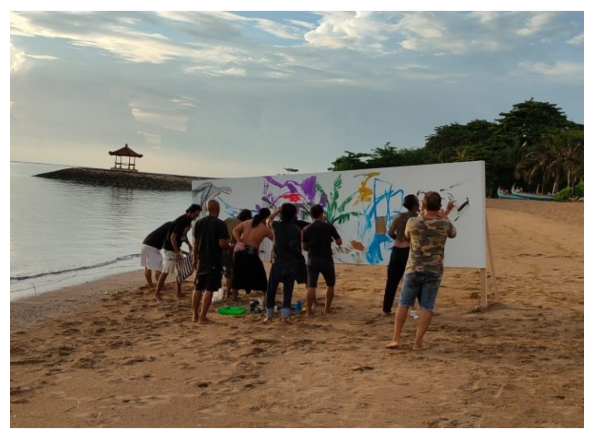
Figure 4. Video playback recording session at Sanur Beach (Source: Gultom, 2021).