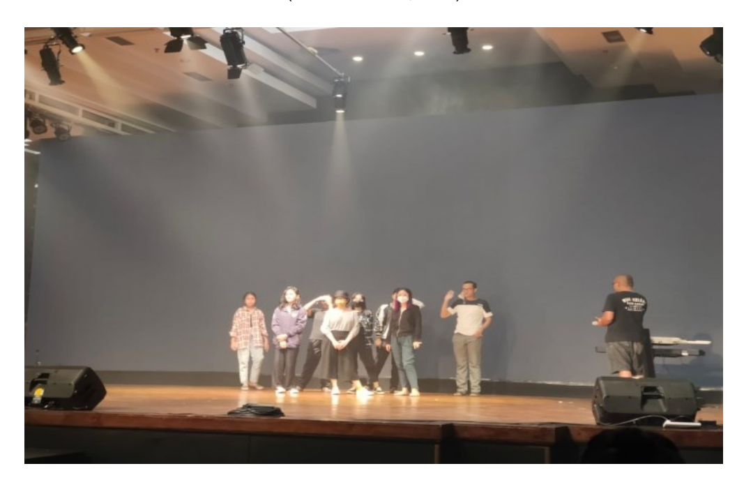
Figure 6. Rehearsal on 9 December at Alaya Dharma Negara Building, Denpasar.