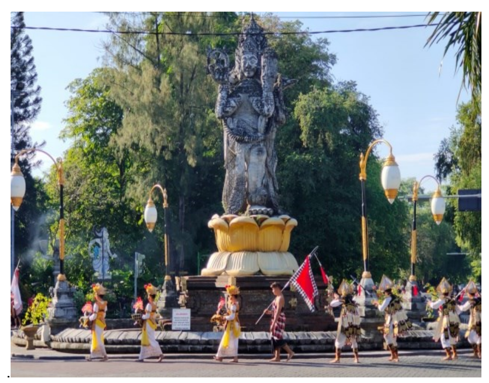
Figure 5. Video playback recording session in Catur Muka