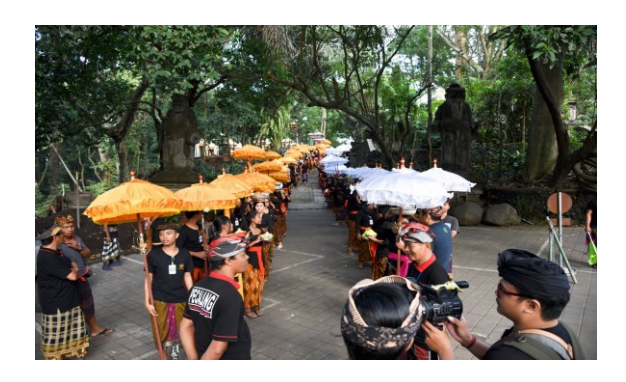
Figure 6. Religious activities by local community in Monkey Forest Ubud

shown in activities that are held every 5 years, namely mass cremation which is held every mid-year. For the activity costs borne from the income of Monkey Forest Ubud, the community is helped in terms of the costs of these activities which are so inconvenient for the people of the Traditional Village of Padang Tegal Ubud to fulfill their obligations.