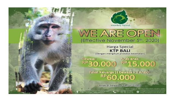
Figure 8. Poster for Re-opening Monkey Forest Ubud

During the temporary closure of Monkey Forest Ubud, the manager implements 3 priority things, namely (1) maintaining the stability of ape feed, (2) Spraying disinfectants in every area that visitors frequent and (3) Forest rejuvenation that supports the tourism area ecosystem this. In a pandemic situation, Monkey Forest Ubud was visited by government stakeholders, namely the Governor of Bali Province, Mr. Wayan Koster on Saturday, July 25, 2020 at the inauguration of the New Era of Bali Life Order and Digitalization at the Qris-based Monkey Forest Ubud and at the same time giving appreciation of the use of language Balinese script and literature according to Governor Regulation Number 97 of 2018 concerning the use of Balinese language and literature and restrictions on the generation of single-use plastic waste, dismaping that Monkey Forest Ubud has a special waste processing site located in the central parking area.