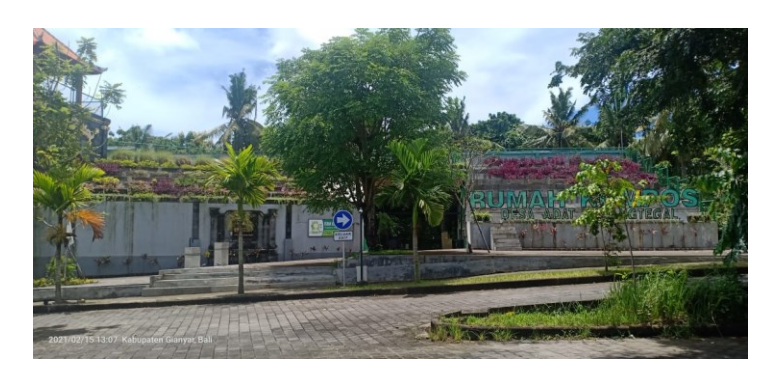
Figure 4. Monkey Forest Ubud waste processing facilities

The Ubud tourism area, which is the location of Monkey Forest Ubud, is experiencing social problems related to congestion on the main route of the Ubud tourism area which passes Monkey Forest Ubud. The management of Monkey Forest Ubud has built a central parking lot as a solution to congestion problems, one of which is illegal parking which violates the parking ban in the Ubud tourism area. From this management, Monkey Forest Ubud management has made a positive contribution related to social problems, namely congestion as an effort to maintain tourism sustainability in the comfort aspect of tourists visiting the Ubud tourism area. This central parking area can accommodate 1000 cars and 500 motorbikes with an area of 3 hectares.