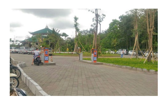
Figure 5. Central parking at Monkey Forest Ubud

The Ubud tourism area, which is the location of Monkey Forest Ubud, is experiencing social problems related to congestion on the main route of the Ubud tourism area which passes Monkey Forest Ubud. The management of Monkey Forest Ubud has built a central parking lot as a solution to congestion problems, one of which is illegal parking which violates the parking ban in the Ubud tourism area. From this management, Monkey Forest Ubud management has made a positive contribution related to social problems, namely congestion as an effort to maintain tourism sustainability in the comfort aspect of tourists visiting the Ubud tourism area. This central parking area can accommodate 1000 cars and 500 motorbikes with an area of 3 hectares.