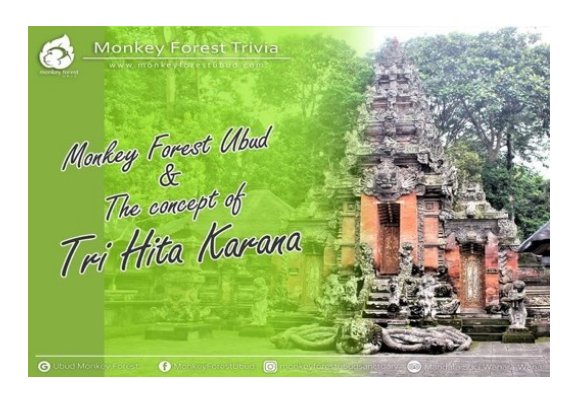
Figure 3. Tri Hita Karana concept publication