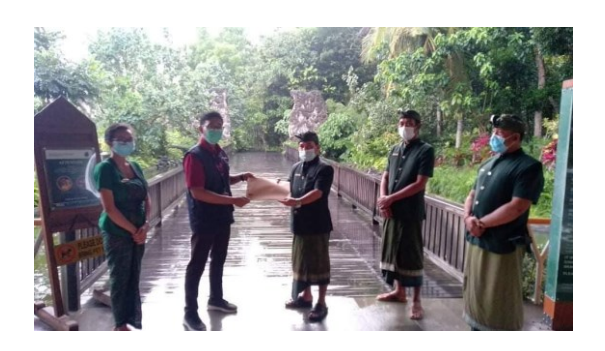
Figure 9. Submission of the CHSE Certificate

Monkey Forest Ubud has received the New Era Bali Life Order service certification to be able to operate again, starting from 5 November 2020 Monkey Forest Ubud is back in operation with standardized health protocols for handling the Covid-19 virus by received a Cleanliness, Health, Safety and Environment Sustainability (CHSE) certificate by the Ministry of Tourism. Monkey Forest Ubud provide special ticket prices for people who have a Balinese Identity Card.