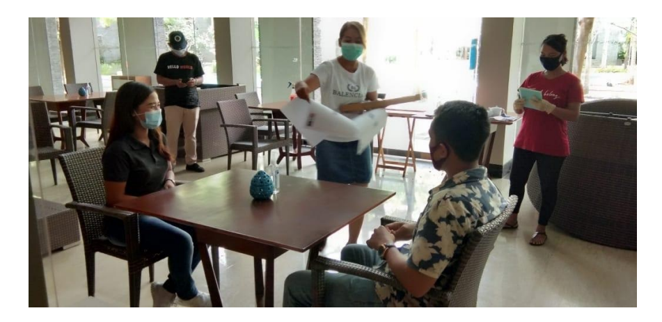
Figure 2. Courtyard by Marriott Bali Nusa Dua Resort Offline Training

participates in online training by entering the application system by selecting EID Registration and EID Support. Management has registered all employees, so employees can just log in with the registration ID that has been provided by Management. There are several modules in the system and each employee is required to complete all existing bills. These online training activities can be carried out by employees in their respective homes.